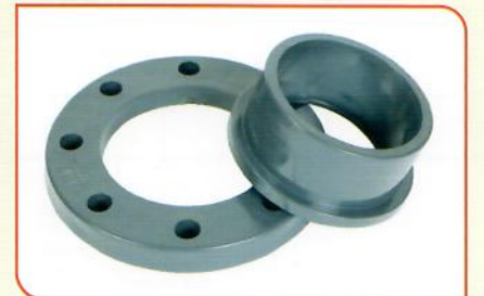
Flange Socket Type 63mm - 110mm