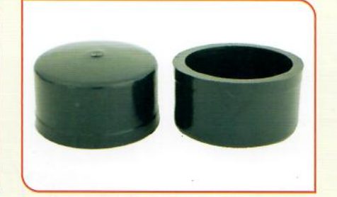
End Cap 25mm - 32mm - 50mm - 63mm - 75mm