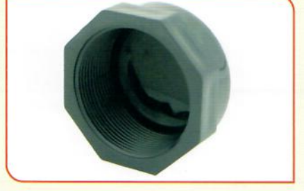
Female Threaded End Cap 50mm (11/2") - 63mm (2")