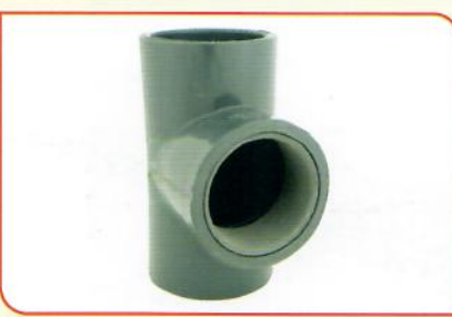
Female Threaded Tee 90° 50mm x 11/2" x 50mm 63mm x 2" x 63mm