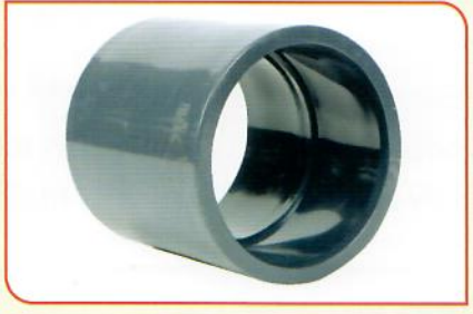
Double Socket 25mm - 32mm - 40mm - 50mm 63mm - 90mm - 110mm