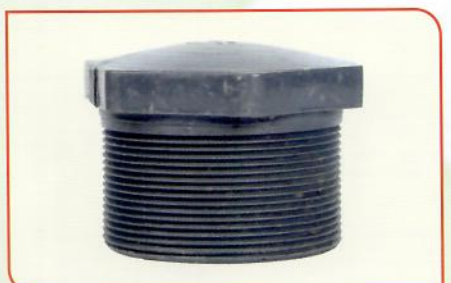
Male Threaded Plug 1/2" - 3/4" - 1" - 11/4" - 11/2" 2" - 3" - 4"