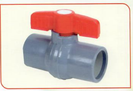
Compact Ball Valve (Isolation Valve) 20mm - 25mm - 32mm - 40mm 50mm - 63mm