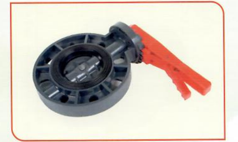
Butterfly Valve 63mm - 75mm - 90mm - 110mm 160mm - 200mm