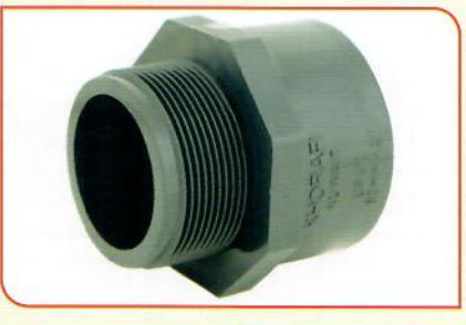
Male Adapter 25mm x 3/4" - 32mm x 1" - 50mm x 11/2" 63mm x 2" - 75mm x 21/2" - 90mm x 3" - 110mm x 4"