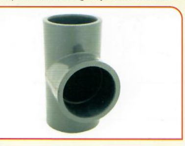
TEE 90° 25mm - 32mm - 50mm 63mm - 90mm - 110mm