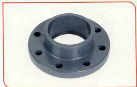
Single Flange 50mm - 63mm - 75mm 90mm - 110mm