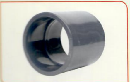
Transition Coupler 25mm x 3/4" - 32mm x 1" - 50mm x 11/2" 40mm x 11/4" - 90mm x 3" - 110mm x 4" 160mm x 6"