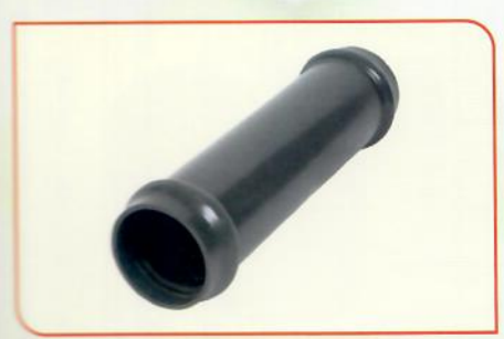
Repair Coupler 50mm - 63mm - 75mm 90mm - 160mm - 200mm