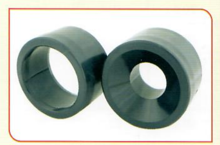
Short Reducing Bushes 25 x 20mm - 32 x 20mm - 32 x 25mm - 40 x 25mm - 40 x 32mm 50 x 25mm - 50 x 32mm - 50 x 40mm 63 x 25mm - 63 x 32 mm - 63 x 40mm - 63 x 50mm - 110 x 50 mm 110 x 63mm - 110 x 75mm - 110 x 90mm