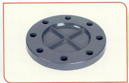
Blind Flange 50mm - 63mm - 75mm 90mm - 160mm - 200mm