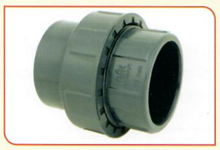
Union 25mm - 32mm - 63mm