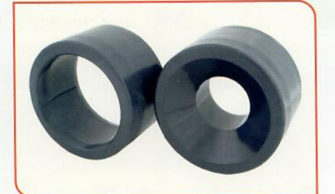
Reducer Bush 25 x 20mm - 32 x 25mm - 40 x 25mm - 40 x 32mm - 50 x 25mm - 50 x 32mm 50 x 40mm - 63 x 25mm - 63 x 32mm - 63 x 40mm - 63 x 50mm - 75 x 50mm 75 x 63mm - 90 x 50mm - 90 x 63mm - 90 x 75 mm - 110 x 50mm 110 x 90mm - 160mm x 110mm - 200 x 160mm