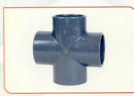
Cross Tee (4 Way) 50mm - 63mm - 90mm - 110mm