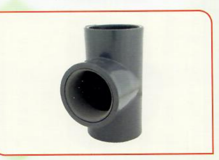
Tee Threaded Plastic 50mm x 11/2" -x 50mm 63mm x 2" x 63mm