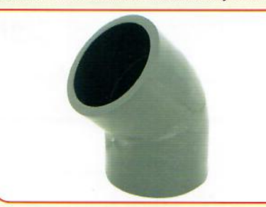
Elbow 45° 50mm - 63mm - 90mm - 110mm