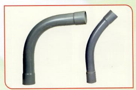
Long Radius Bend 90° / 45° 50mm - 63mm - 75mm - 90mm 110mm - 160mm - 200mm