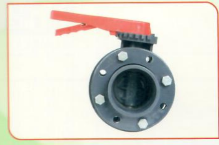
Butterfly Valve (Full set) 50mm - 75mm - 90mm - 110mm 160mm - 200mm