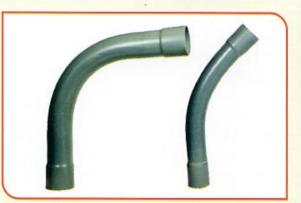
Long Radious Bend 90° / 45° 50mm - 63mm - 75mm - 90mm 110mm - 160mm - 200mm