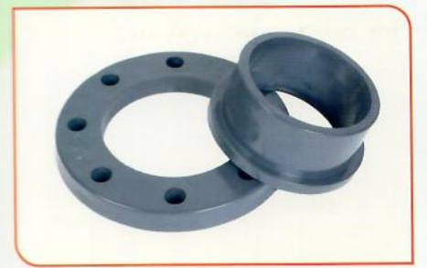
Flange (Ring with Stub) 50mm - 63mm - 75mm - 110mm 160mm - 200mm - 250mm - 315mm