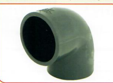
Elbow 90° 20mm - 25mm - 32mm -40mm 50mm - 63mm - 90mm- 110mm

UPVC / PVC Pressure Pipes Fittings Manufactured According to DIN 8063 UPVC / PVC Pressure Pipes Fittings using for Pressure Water Line, Electrical System, Cable Duct System, Drainage System. PN 16 BAR