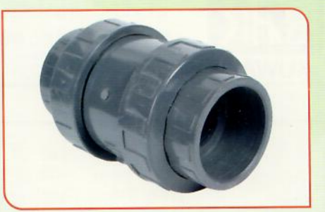
Check Valve Spring / Ball Type (Socket Type) 25mm - 32mm - 50mm - 63mm 75mm - 90mm - 110mm