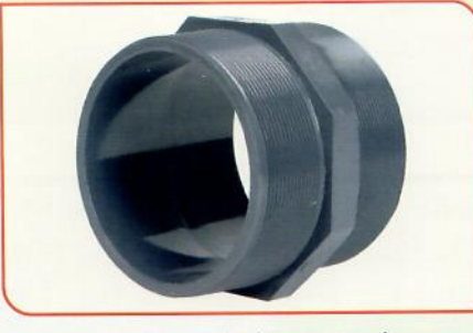
Male Threaded Hex Nipple 1/2" - 3/4" - 1" - 11/4" - 11/2" 2" - 3" - 3" - 4"